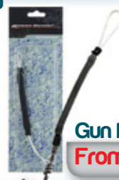
Gun Bungees From: $9.95