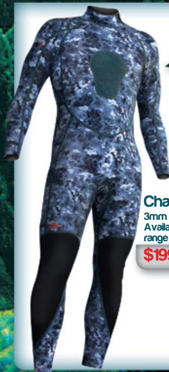
Chameleon X-3 3mm 1 piece wetsuit Available in a wide range of sizes $199.95