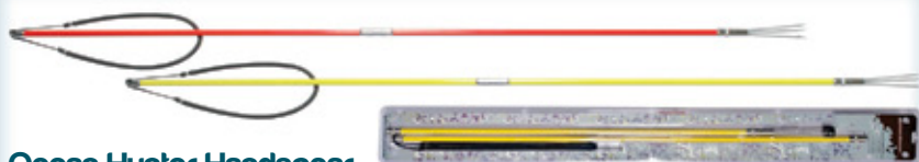
Ocean Hunter Handspear Red or Yellow Available in 1500cm and 2000cm From: $39.95