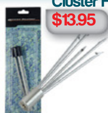
Cluster Head $13.95