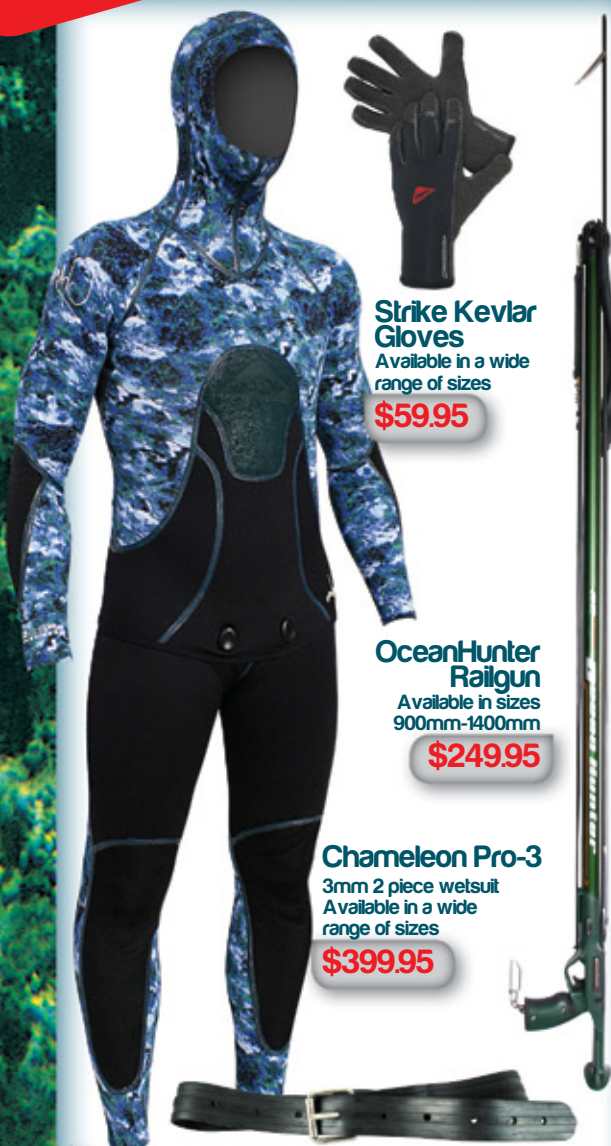
Strike Kevlar Gloves Available in a wide range of sizes $59.95