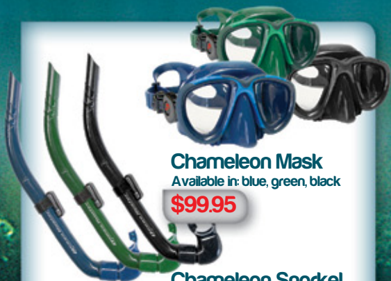
Chameleon Mask Available in: blue, green, black $99.95