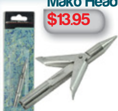
Mako Head $13.95